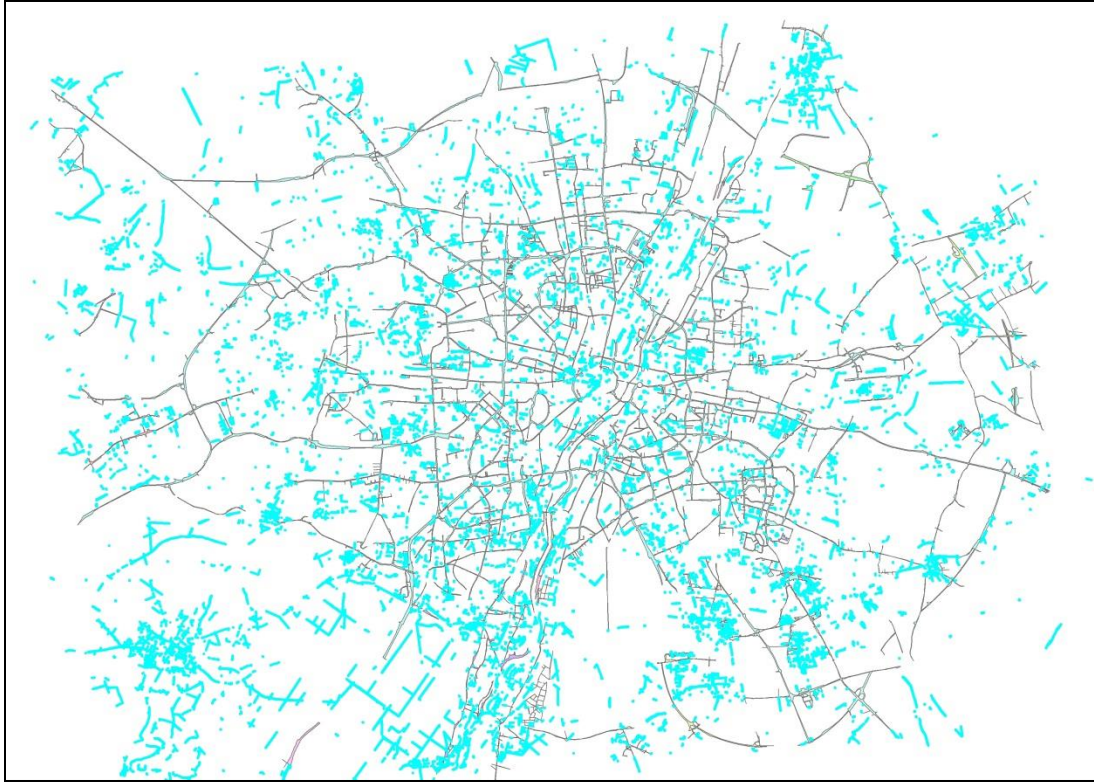
Figure 2 Extraction results