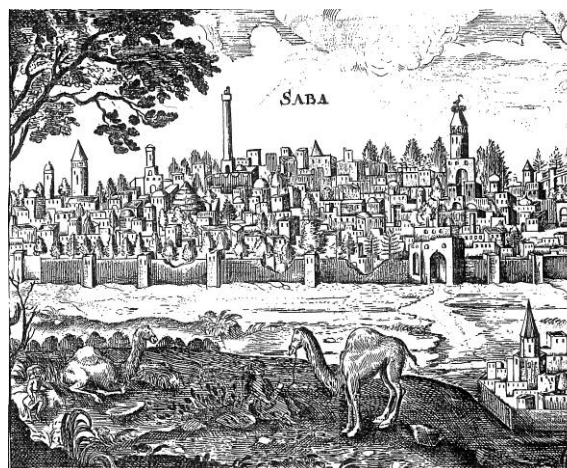
Figure 1: The painted landscapes of Saba city in ancient Persia by Adam Olearius in 1633

(r. 1588-1629) came to power and ran an outward looking agenda, the country has opened its doors to travelers, and in particular, the Europeans. It has been mentioned in their travel writings that the people in Europe and Iran became familiar with each side's traditions. The descriptions of the travel routes in the travelogues reveal a lot of information about the history and the historical development of the roads and travel corridors through/in Iran [3,4]. For instance, one can identify the common routes between cities which they were being taken in their itineraries. The travelogues provide us information about the conditions of the travel's amenities including security, travel permission, overnight and restaurant facilities, etc. The on-the-way cities and their physical appearance as shown in Figure 1 can be rebuilt through mapping their textual reports.