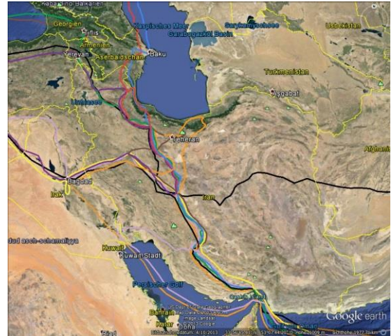
Figure 2: the primary routes of the nine European Explorers

Visual analysis of the taken routes reveals that the Iran plateau and its southern marine territories were the main corridor of explorations and travels from west to east. To be more precise, while these travellers started their journeys from different places of Europe and they navigated themselves through different corridors until the Iran plateau, they all pursued their routes either through the central Iran or the Persian Gulf sailing ways. This could be due to geographical conditions or cultural attractiveness. The literature review confirms that the latter is the case.