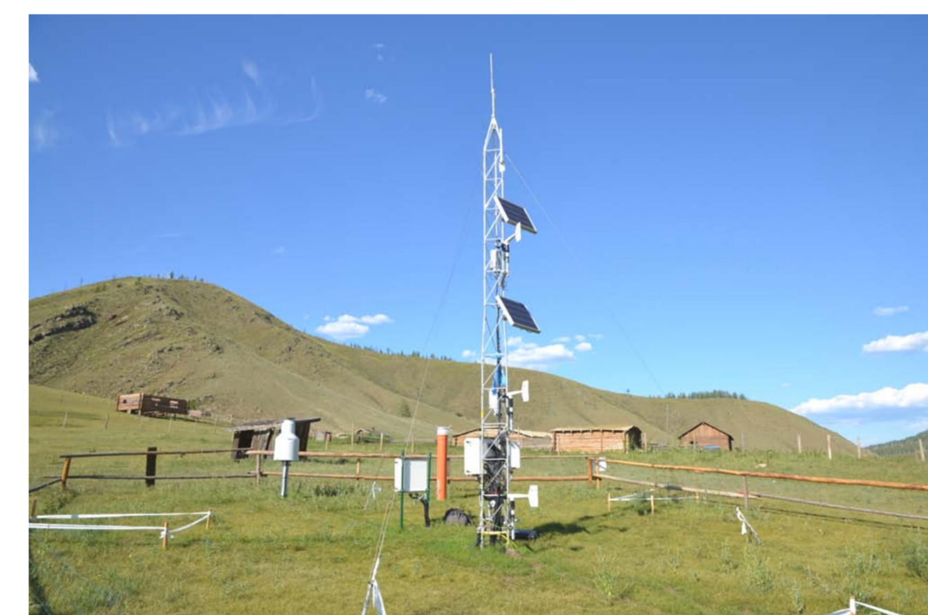
Fig. 3. Main hydrometeorological station in the Sugnugur valley.

In the upper part of the catchment three soil moisture transects were installed in the south exposed, forested north exposed and burned north exposed hill slopes accompanied by infiltration and precipitation measurements. Soil moisture sensors (FDR) were used in triple replicates at each transect point to account for soil heterogeneity. Two temporary meteorologic stations and river gauges were installed in two valleys of the Sugnugur headwaters to account for assumed spatial differences in weather conditions and hydrological characteristics.