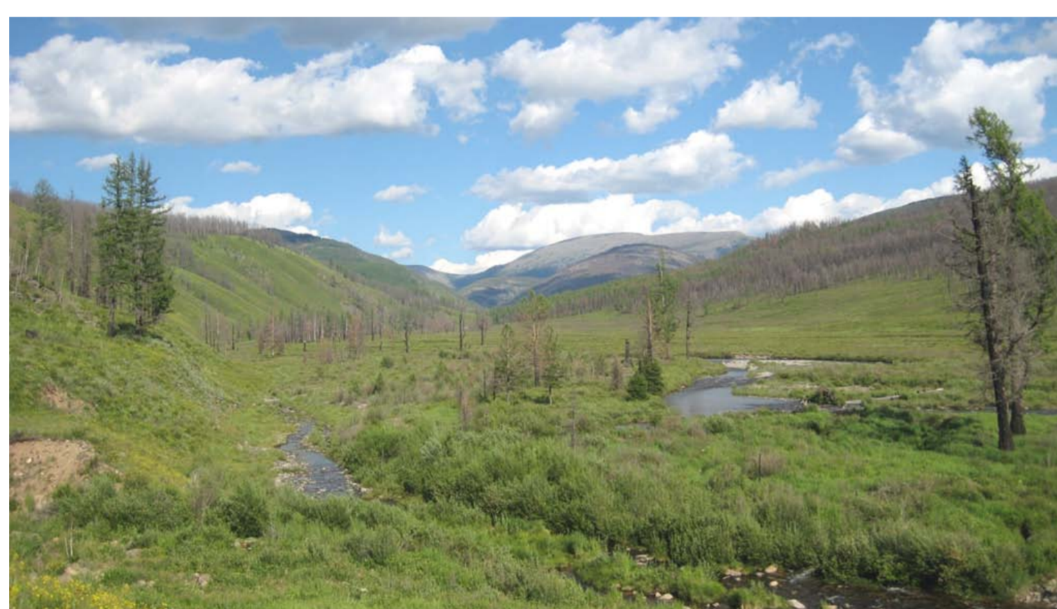
Fig. 1. Headwater of the Kharaa river in the Khentii mountains.

temperature, relative humidity, wind speed and direction and precipitation as well as snow height in winter.