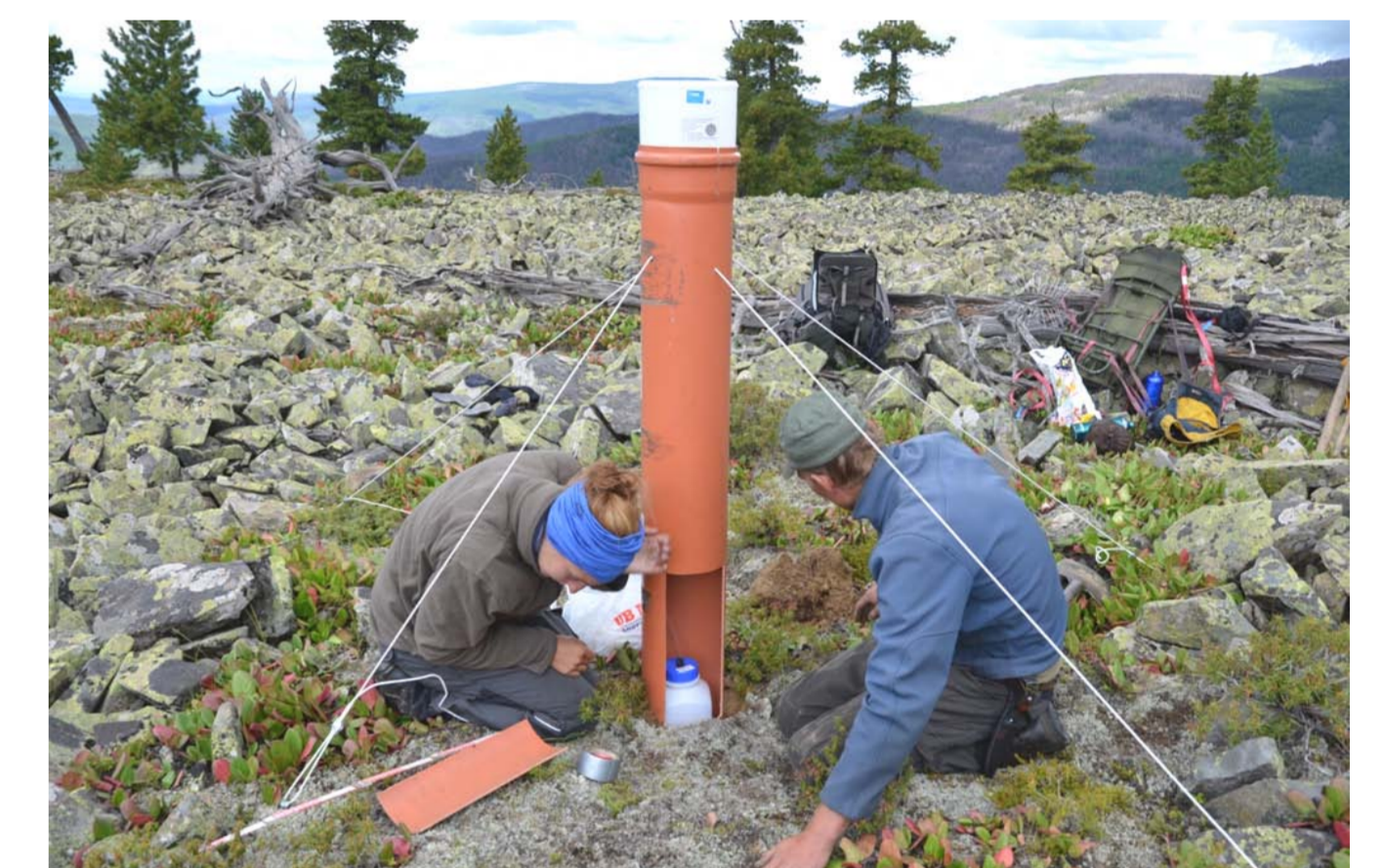
Fig. 4. Installation of the rain gauge at the highest elevation (2026 m).

Three additional rain gauges have been installed at different elevations (1193 m, 1483 m and 2026 m) to measure an altitude dependent gradient in annual precipitation in order to improve hydrological modeling (Fig. 4).